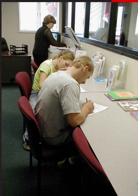
Job seekers attend to paperwork in the Career Resource Center